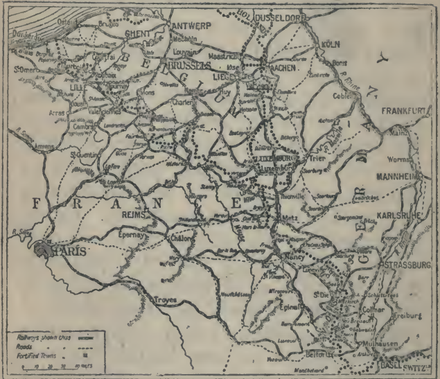
COPYRIGHT, SPECIALLY PREPARED FOR The Daily Telegraph by GEOGRAPHIA, LTD.